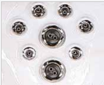
Large 5" Jets

Provide an elegant, glimmering accent that is also corrosion resistant.